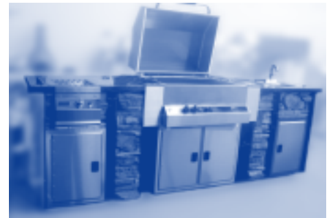
Outdoor kitchen displays such as this one can be seen at Palmetto Propane showrooms and Builders' Night events.

Islands by Design , based in Concord, NC,